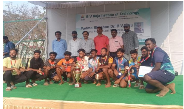
Volleyball(M) Runner's Feb'24 Dr.BVRIT National Level Sports Fest