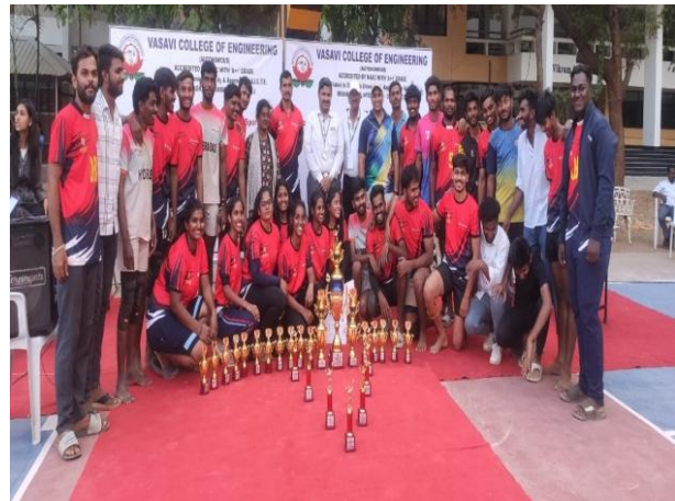
Volleyball and Kabaddi (M&W) Winner SPARDHA'24 National Level Sports Fest March'2024, Vasavi College of Engineering