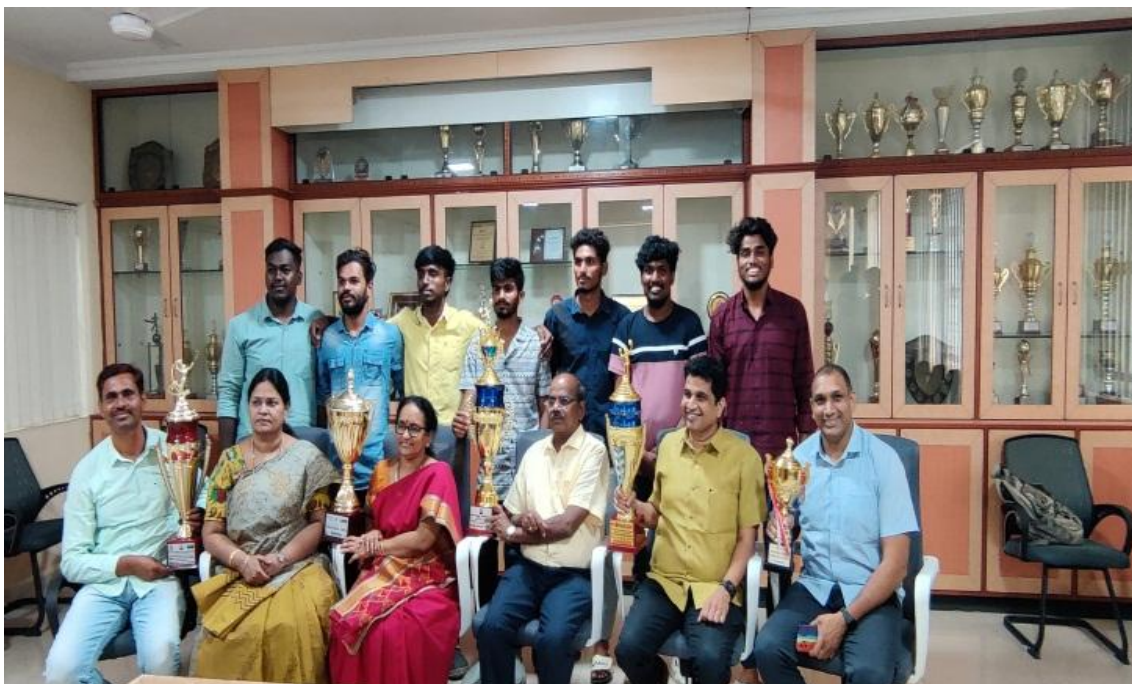
Volleyball Winner's Trophies in Various Tournamnets 2023-24 with Principal, VJIT