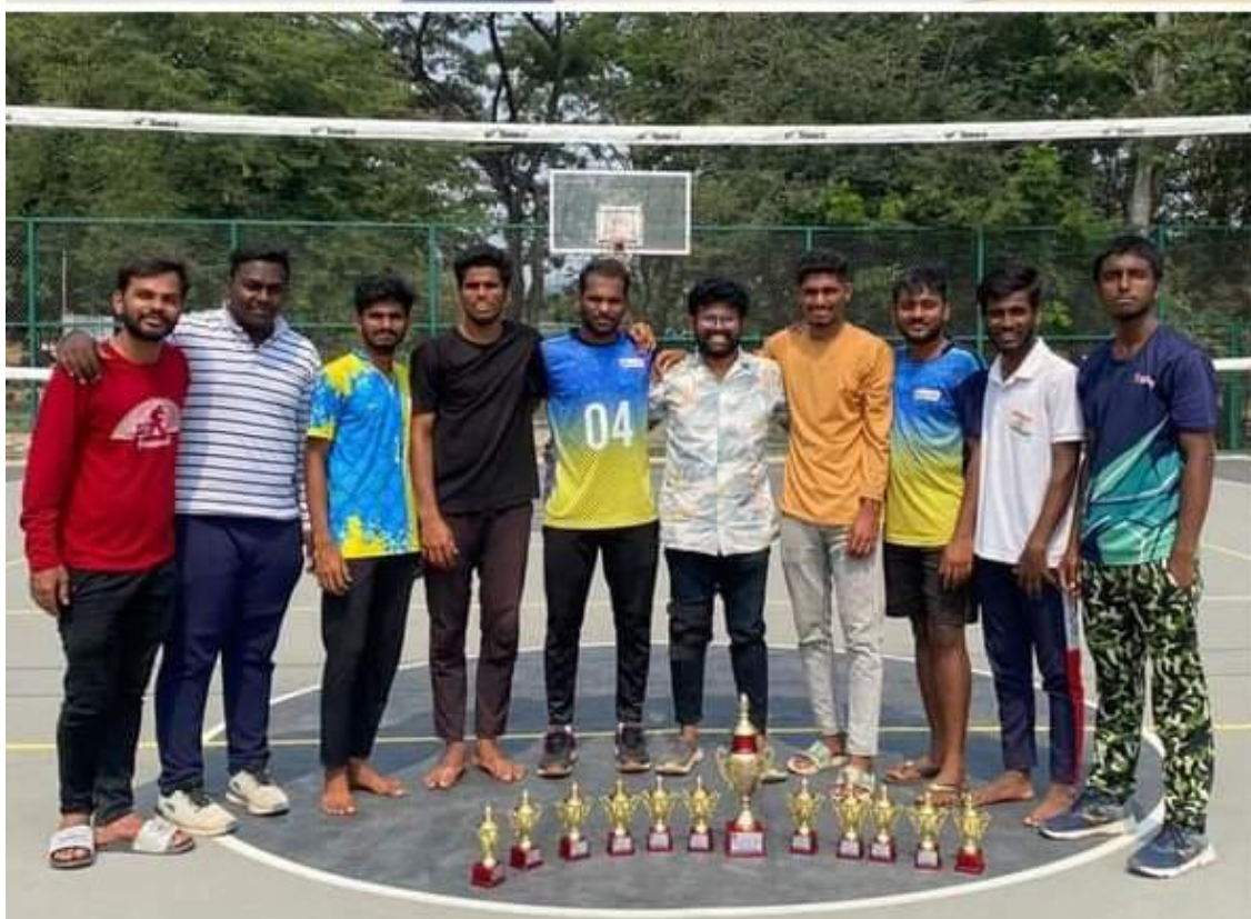
MGIT SPORTS FEST 'EKALAVYA'23 VOLLEYBALL RUNNER'S