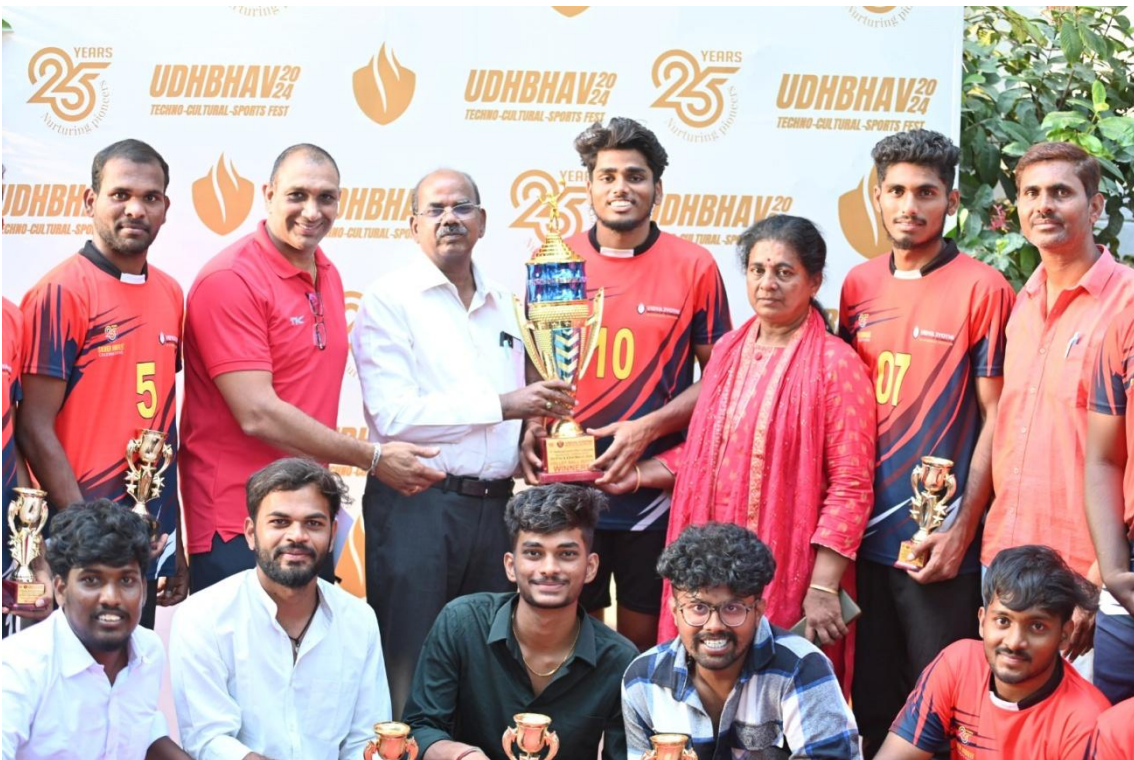
11 th National Level Sports Fest'2k24 VOLLEYBALL(M) WINNER'S