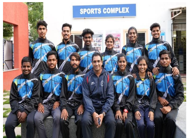
STUDENTS REPRESENTED VARIOUS TEAMS in JNTUH 2021-22