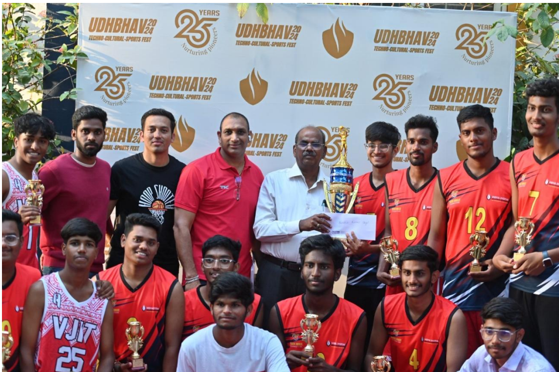
11 th National Level Sports Fest'2k24 BASKETBALL (M) RUNNER'S