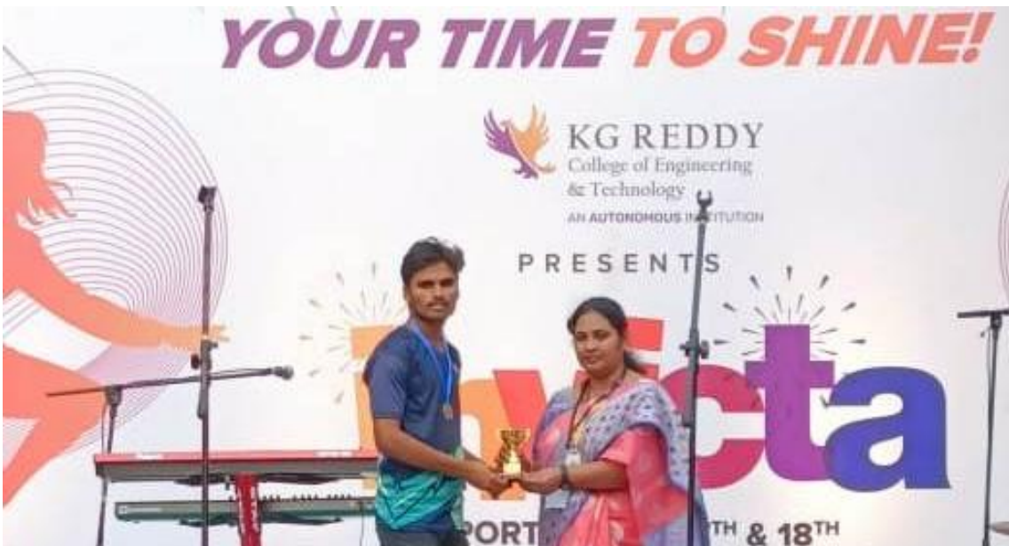
KG.REDDY 'INVICTA' SPORTS MEET APRIL'2023 TABLE TENNIS (SINGLES)- RUNNER