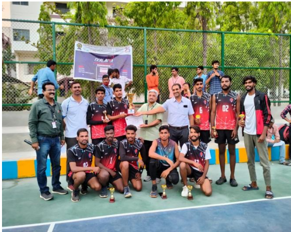
VOLLEYBALL 'WINNERS' MGIT SPORTS MEET EKALAVYA APRIL-22