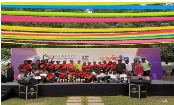
SPORTS&CULTURAL WINNER'S March'2k24, K.G.REDDY INVICTA'24