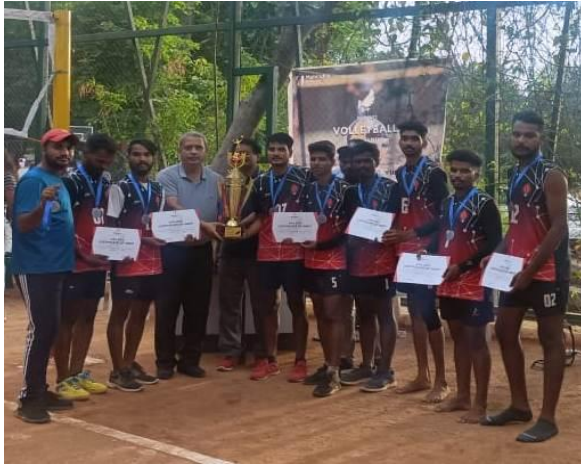
VOLLEYBALL 'RUNNERS' MAHENDRA UNIVERSITY AIRO SPORTS FEST MAY'2022