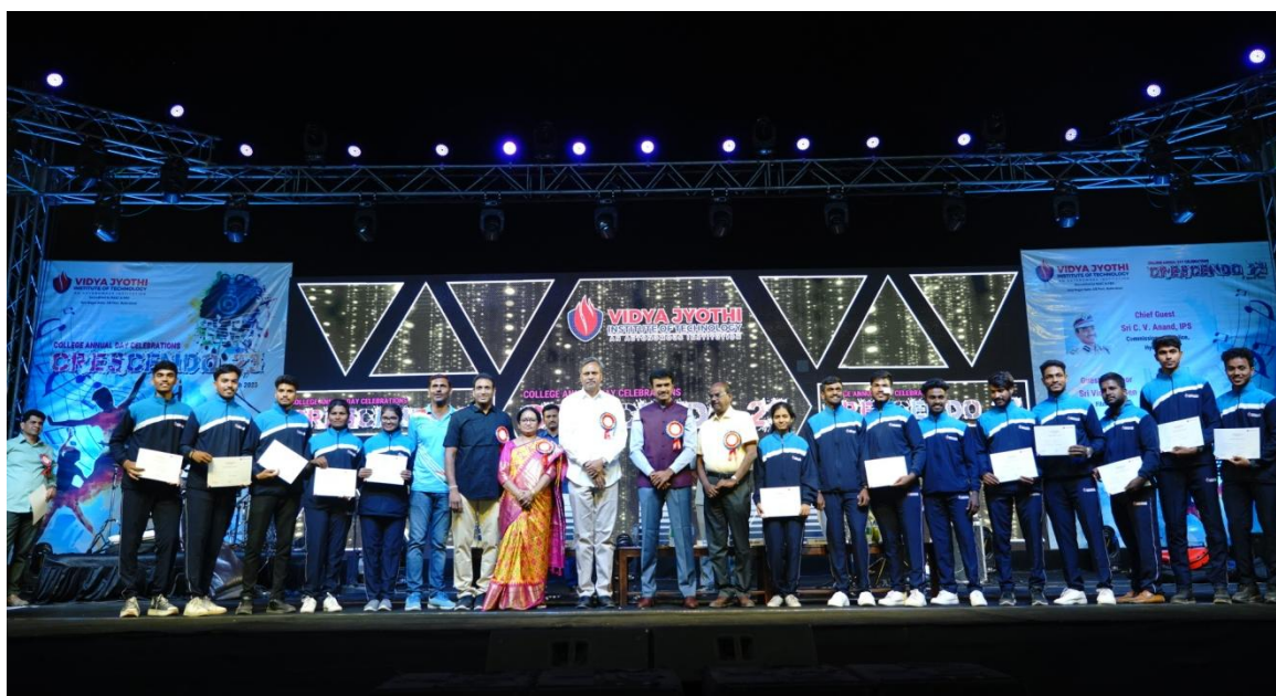
JNTUH Represented Students-2023