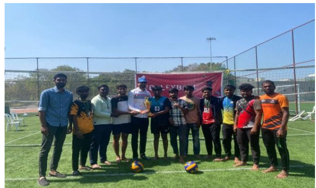
Volleyball Runners-2024, Sports Fest Mahendra University National Level