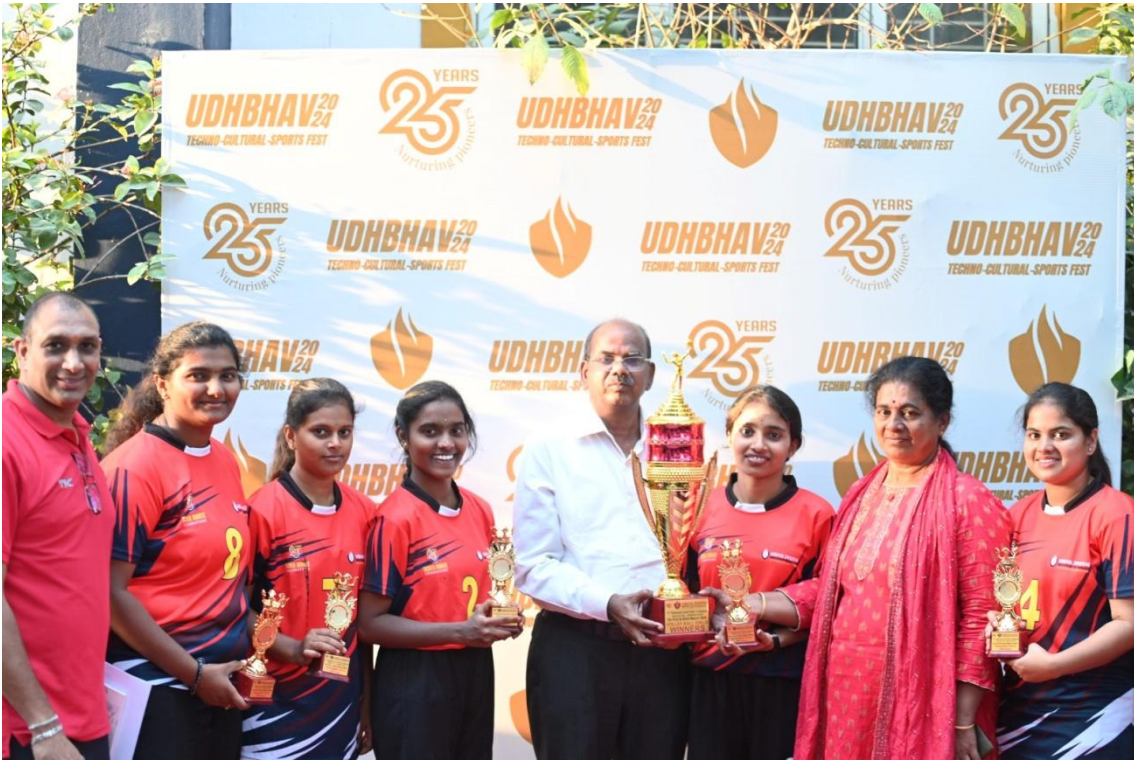
11 th National Level Sports Fest'2k24 VOLLEYBALL(W) WINNER'S