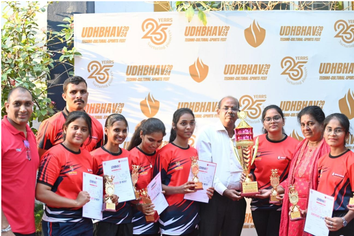
11 th National Level Sports Fest'2k24 KABADDI(W) WINNER'S