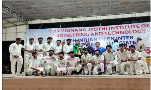
CRICKET-WINNER'S 15th Indian Open Sports Fest Dec'2023