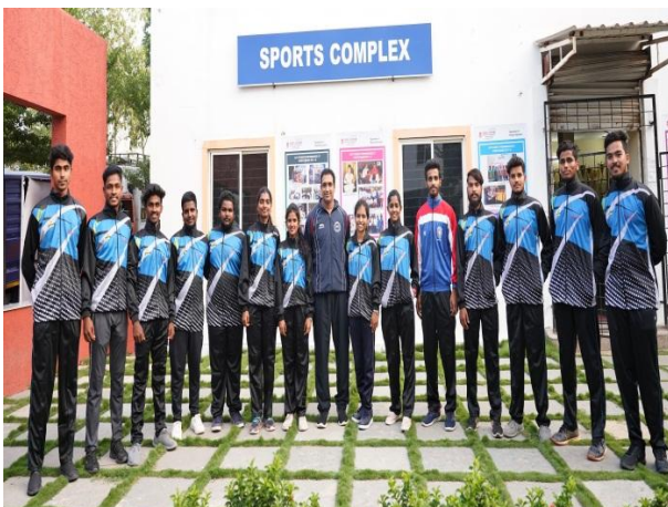
STUDENTS REPRESENTED VARIOUS TEAMS in JNTUH 2021-22