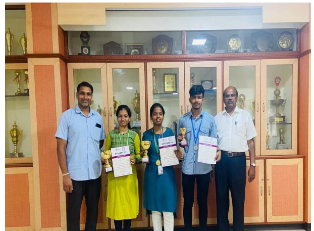
CHESS-'WINNER' JBIET AARAMBH STATE LEVEL SPORTS FEST MAY'2022