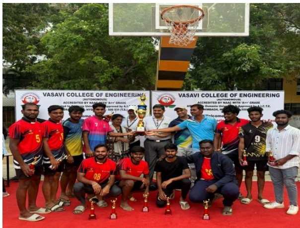
Volleyball(M) Winner SPARDHA'24 National Level Sports Fest March'2024, Vasavi College of Engineering