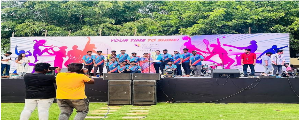
KG.REDDY 'INVICTA' SPORTS MEET APRIL'2023 CRICKET-WINNER'S