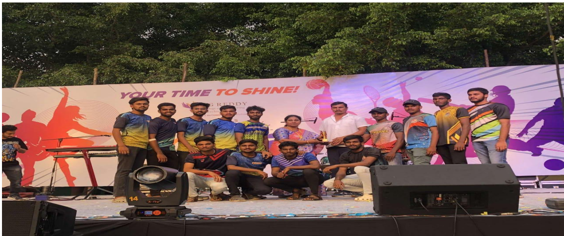
KG.REDDY 'INVICTA' SPORTS MEET APRIL'2023 KABADDI-RUNNER'S