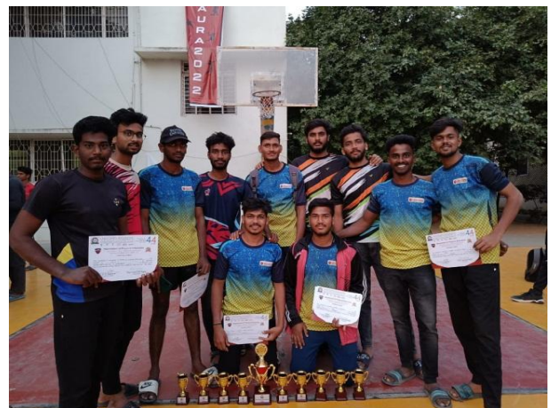
KABADDI-'RUNNERS AURA'2022, CBIT SPORTS FEST APRIL'2022