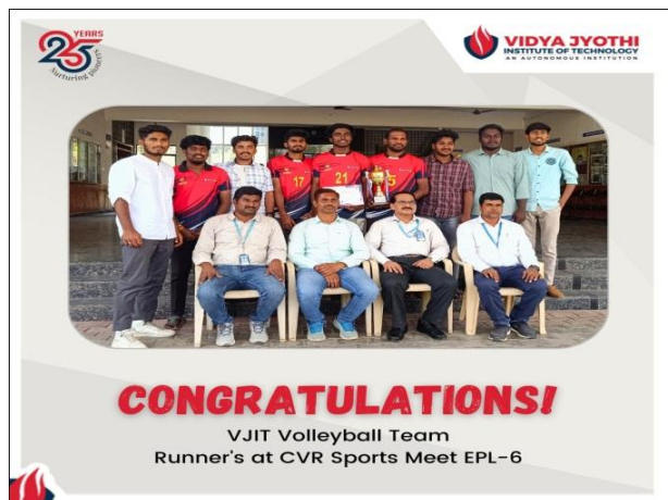
Volleyball Runner's CVR Sports Meet EPL'6 Feb'2024