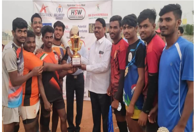
KABADDI-'RUNNERS' MALLA REDDY UNIVERSITY SPORTS MEET DEC'2021