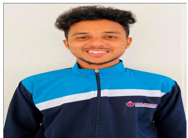
G.NAVEEN III-CSE-DS JNTUH FOOTBALL SOUTH ZONE UNIVERSITY TEAM-2023