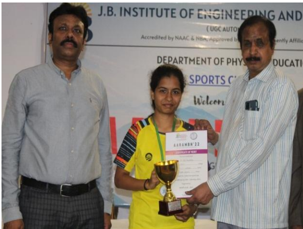
TABLE TENNIS-'WINNER' JBIET AARAMBH STATE LEVEL SPORTS FEST MAY'2022