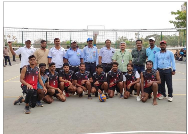
VOLLEYBALL 'WINNERS' MGIT SPORTS MEET EKALAVYA APRIL-22