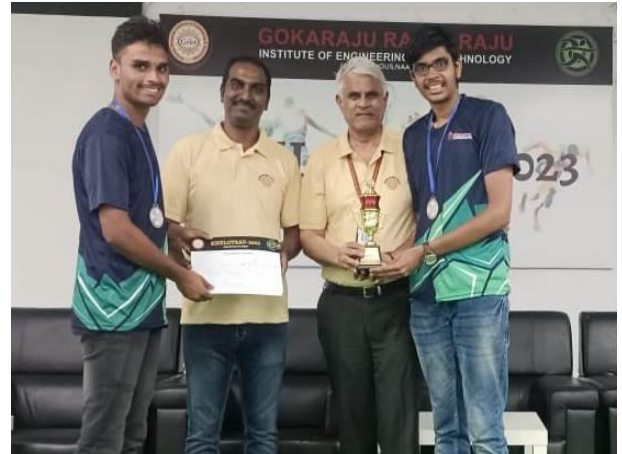
TABLE TENNIS (DOUBLES)-RUNNER'S GRIET 'KHELOTSAV' SPORTS FEST APRIL'2023