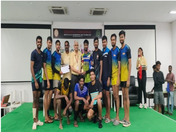
KABADDI-RUNNER'S GRIET 'KHELOTSAV' SPORTS FEST APRIL'2023