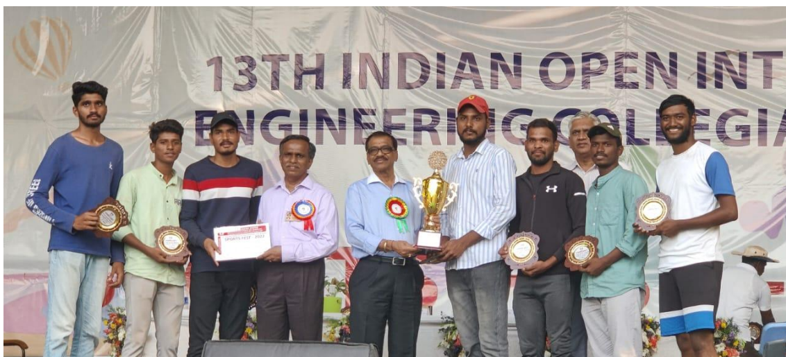
VNR VJIET 13th INDIAN OPEN SPORTS FEST JUNE'2022 VOLLEYBALL-'WINNERS'