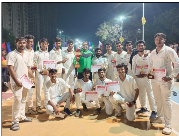
CRICKET-WINNER'S VNR VJIT Indian Open Sports Fest'2023-24