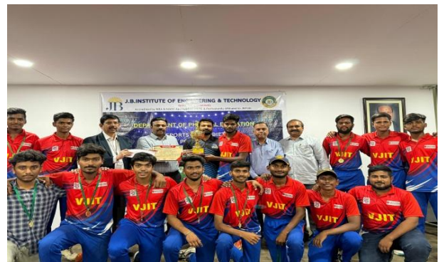
CRICKET Winner JBIET Aarmbh'2024