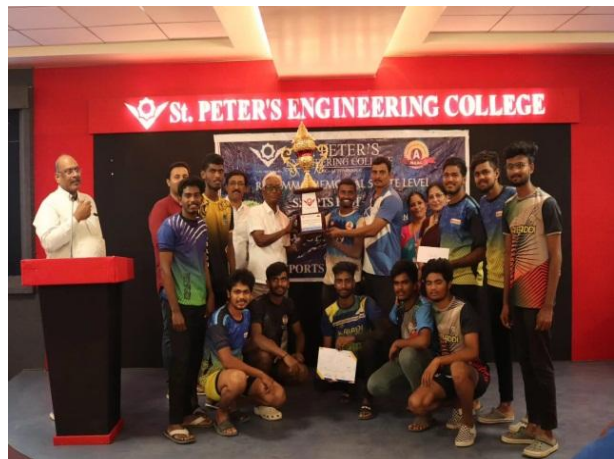
KABADDI-WINNER'S ST.PETER'S ENGINEERING COLLEGE SPORTS FEST June'2023