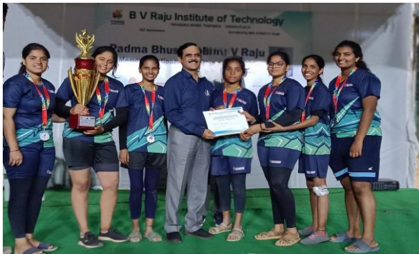
Kabaddi(W) Runner's Feb'24 Dr.BVRIT National Level Sports Fest