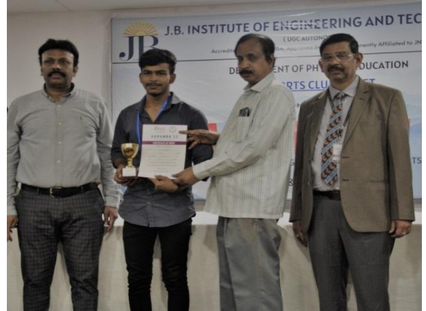
CHESS-'RUNNER' JBIET AARAMBH STATE LEVEL SPORTS FEST MAY'2022