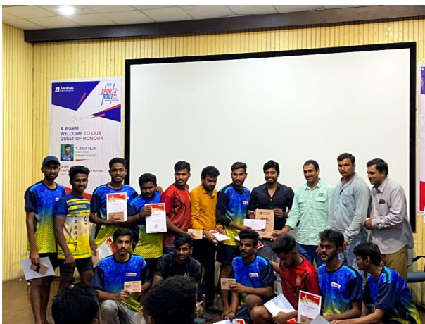
KABADDI-'RUNNERS ANURAG UNIVERSITY SPORTS FEST APRIL'2022