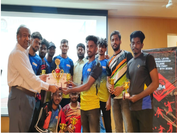
KABADDI-RUNNERS CBIT SPORTS FEST AURA NOV'2022