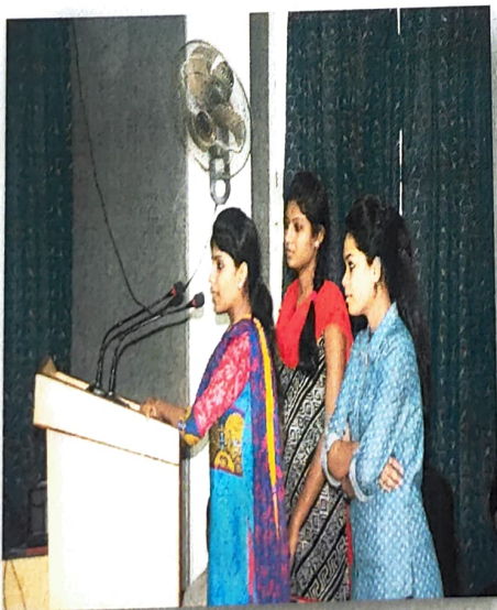
Students Participation on theme