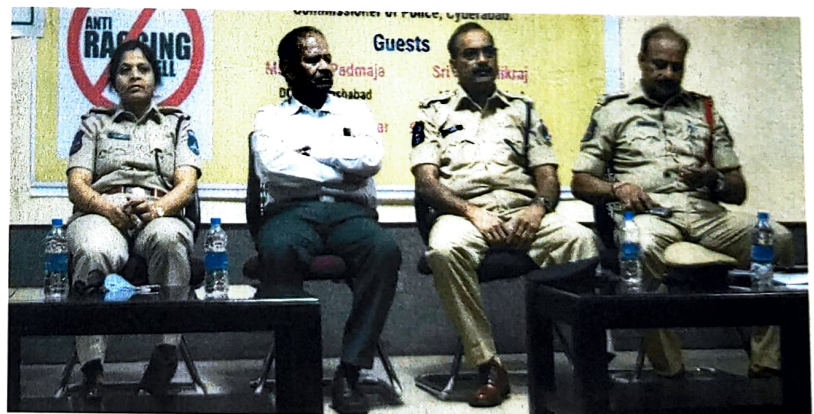
Guests with Director, VJIT