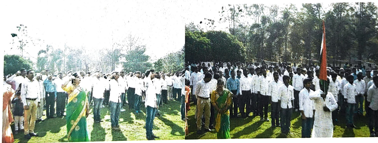
Salute to National Flag

The vastness and the diversity of India is always talked about, but Our India has many other great characteristics as well, there is a lot of diversity in India. India is a large country. And there is simplicity among the people of India. There is unity running through all the parts of the country and that is what is our strength; the strength of our Nation. Strength of our country has been sustained over centuries together. Every era has seen the attempts to boost it further. They have been moulded according to the requirements of realising the dreams for the future, they have been nurtured and it is due to that only that this country has reached this far with our age old traditions and ever new resolves. Our unity, simplicity, fraternity, harmony are our biggest strength. This strength should never be blemished, it should never be hit. If the unity of the country gets disturbed, the dreams also get shattered, therefore, whether it is the poison of casteism, communal fanaticism, we don't have to allow it in any form whatsoever, not allow it to take root, and then we have to cure the poison of casteism, the fanaticism of communalism with the nectar of development, distribute the flow of the nectar of development and through the flow of this nectar attempt bringing about a new awareness..