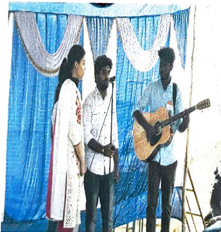
Cultural By students

Felicitation was done to them on hands of Director and Principal of VJIT. Day was ended with cultural events and National Anthem