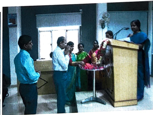
Offering flowers to Dr. Sarvepalli Radhakrishnan