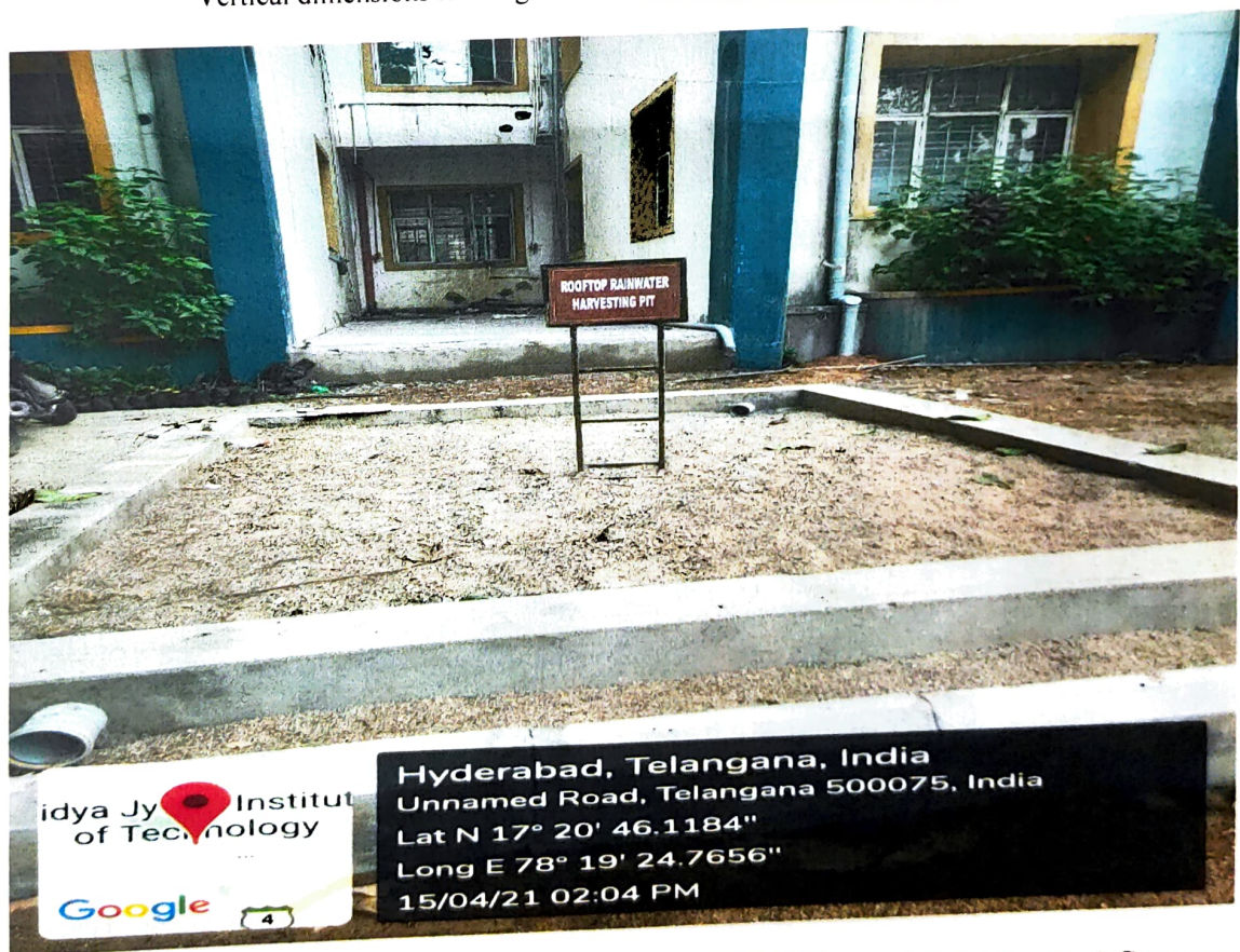
Roof top Rain Water Harvesting Pit of Size 10ft X 10ft X 8ft in VJIT, Hyderabad Campus